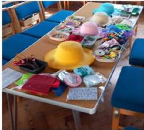
Resources for decorating an Easter hat ready for the Hat Parade at 3.45pm! (see the results above)