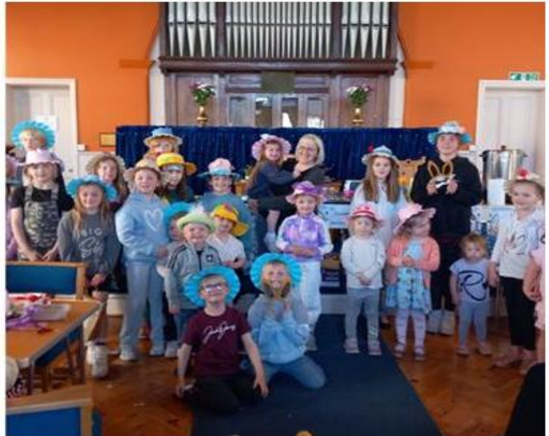
Held from 2pm – 4pm on Saturday April 5 th

We provided scrummy cakes and drinks and people kindly donated towards the Refreshments.