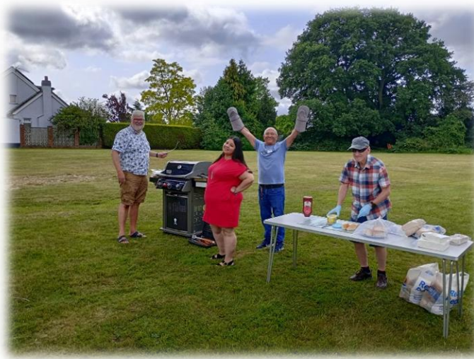
Team BBQ at our recent Father's Day Parade