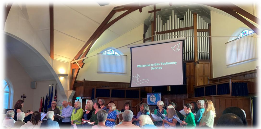
Testimony Service at Rayleigh Methodist Church