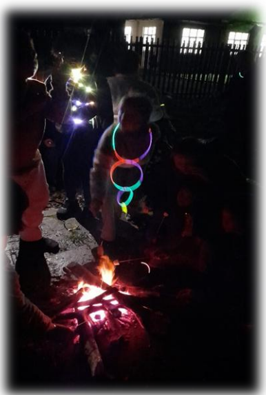
Campfire at Messy Church Light Party