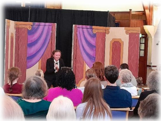
Dan in the Den Show (by Oddments Theatre)

Messy Church was something already running once a month at RMC and is always a lot of fun. Last year we did a special October Messy Church as a light party, which brought along some new faces, some of whom have visited us again since. Last month, our new Drama Club came and performed the Bible story during our worship section which was really special and brought a few of them to church for the first time.