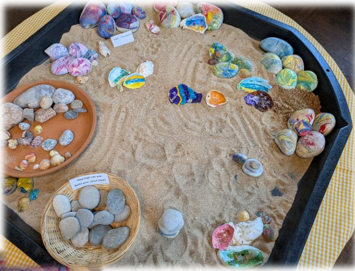
Craft group marbled some stones and painted shells

At Chalkwell Park Methodist, for our Church Anniversary weekend we had an exhibition on the theme 'Gift of Colour' with organisations and individual members contributing some form of craft / photos. One of the exhibits consisted of photos. Cards had also been printed with their outlines for people to colour. As people were chatting over refreshments, you could see them colouring or putting in jigsaw pieces in one of the colourful jigsaws that had also been put out. A lovely social occasion.