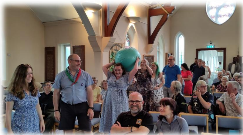
'Over and under' at our Father's Day Parade